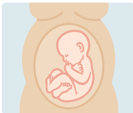
1 Baby in breech position